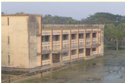
River dried up.

non feasible solution for the project. Bypassing the root cause of water logging, restructuring and rehabilitations of KJDRP was officially completed in 2004.